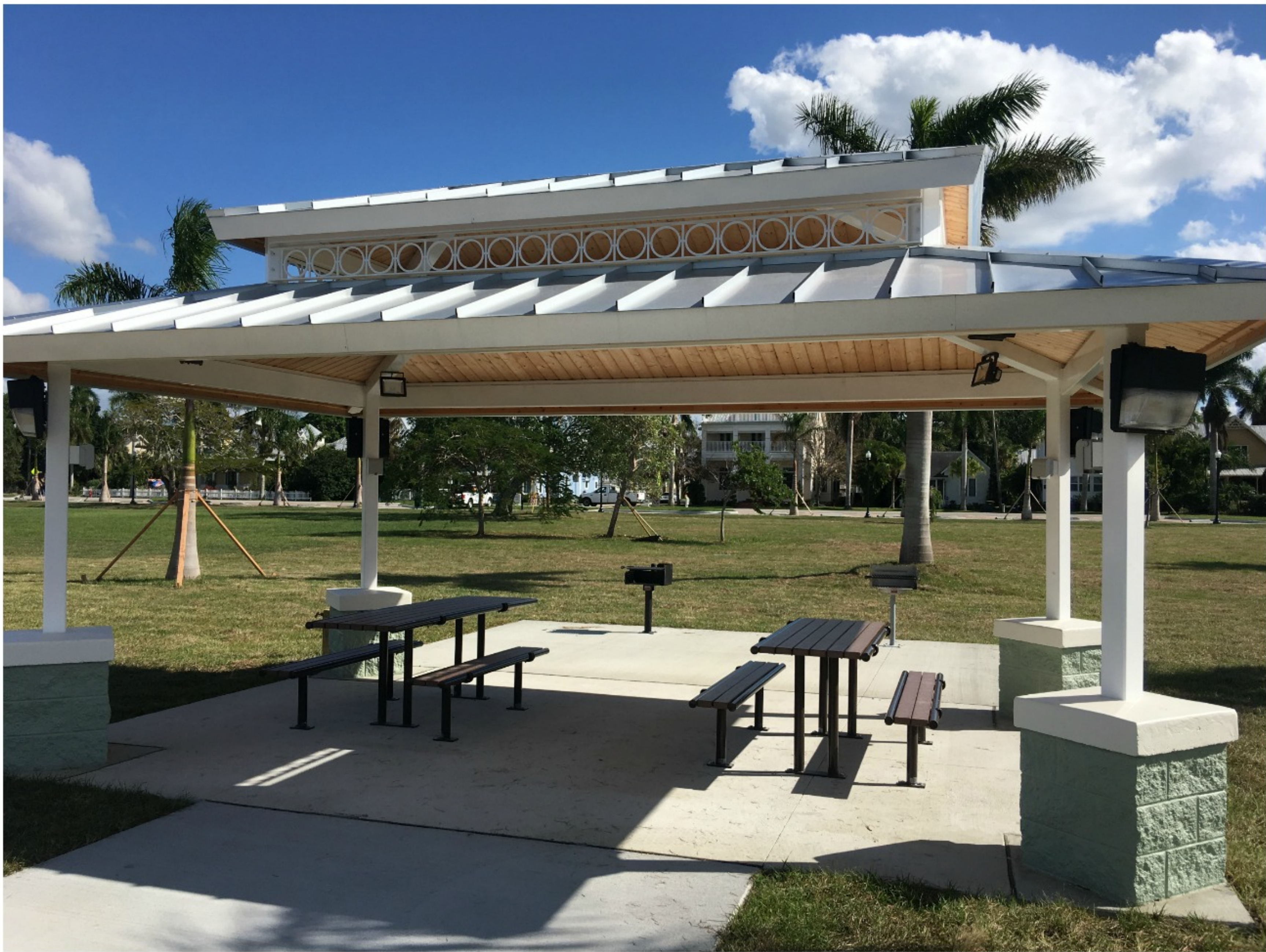
Gilchrist Small Shelter