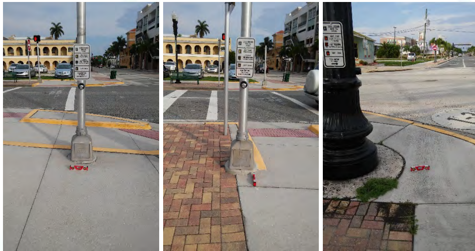
Figure 4-2 – Pedestrian Push Buttons

ADAAG 302.1 states that, “Floor or ground surfaces shall be stable, firm, and slip resistant.”