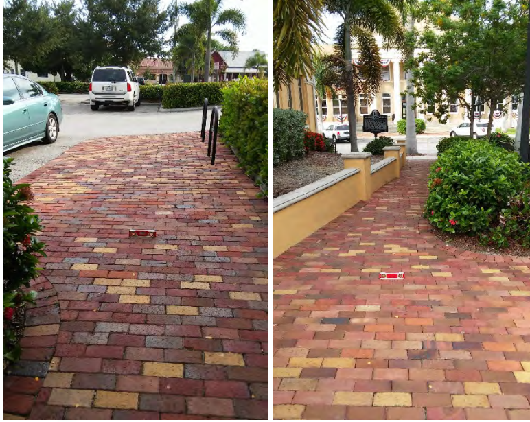
Figure 4-2: Non-Accessible Cross Slopes

ADAAG 403.3 states, “The running (perpendicular) slope of a walking surfaces shall not be steeper than 5%. The cross (perpendicular) slope of a walking surface shall not be steeper than 2%.”