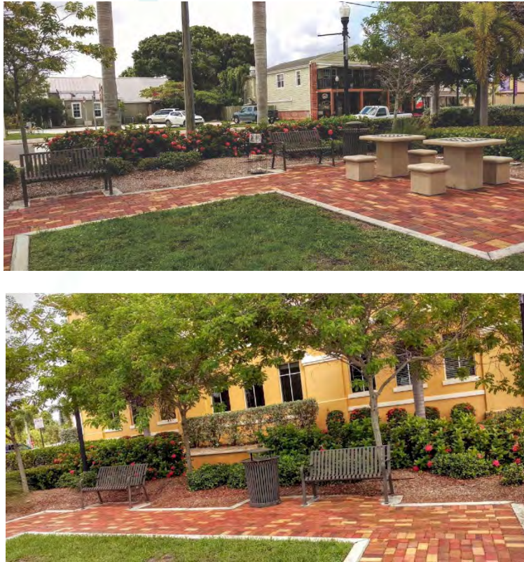
Figure 4-3: Non-Accessible Corss Slopes

There are various benches within the Hector House Plaza, as shown below.