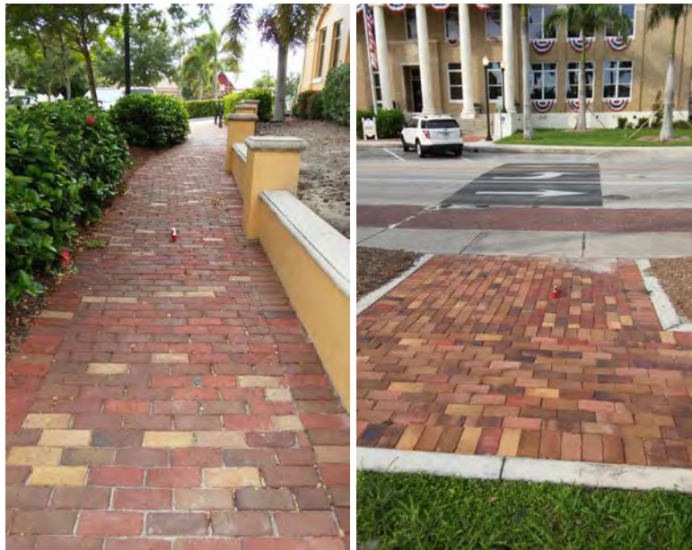
Figure 4-1: Non-Accessible Running Slopes

Sections of the accessible route leading to and from the two accessible parking spaces have non-accessible cross and running slopes. Figure 4-1 shows locations with running slopes of approximately 6%. Figure 4-2 shows locations with cross slopes of approximately 3%.