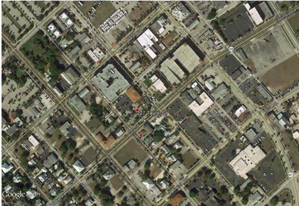
Figure 1-1 - Location Map