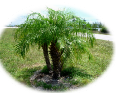
Pygmy Date Palm