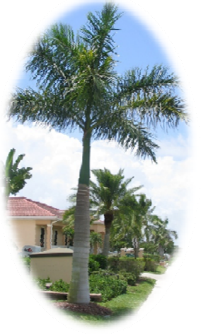
Florida Royal Palm