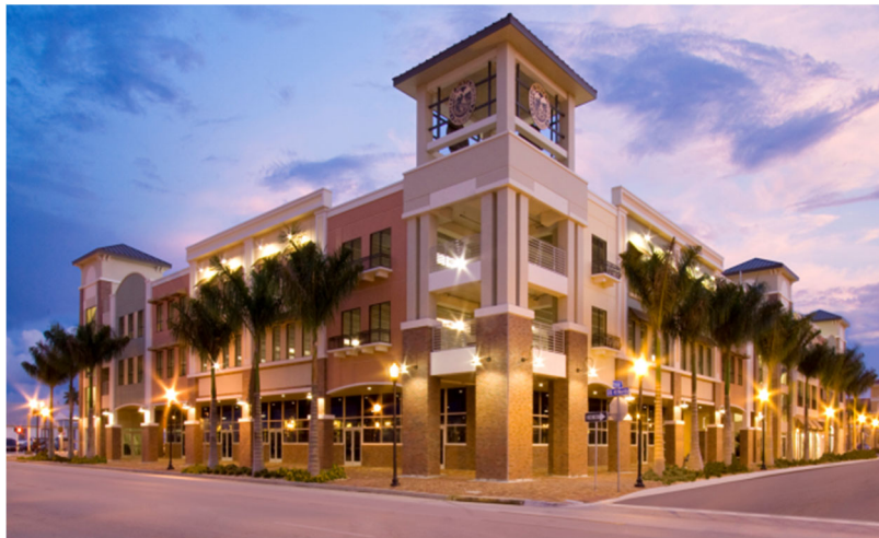
Figure 5: Fawley Bryant Photo of Herald Court Parking Centre 2009

Downtown Redevelopment activity also includes the construction of a 400 space municipal parking structure known as Herald Court Centre. Located in the heart of the historic business district, it is a catalyst for future development without risking further destruction of historic buildings due to parking lot construction. Herald Court Centre includes facades which blend into the pattern typically found on historic main streets. The Centre also contains 17,000 square feet of retail space on the ground floor.