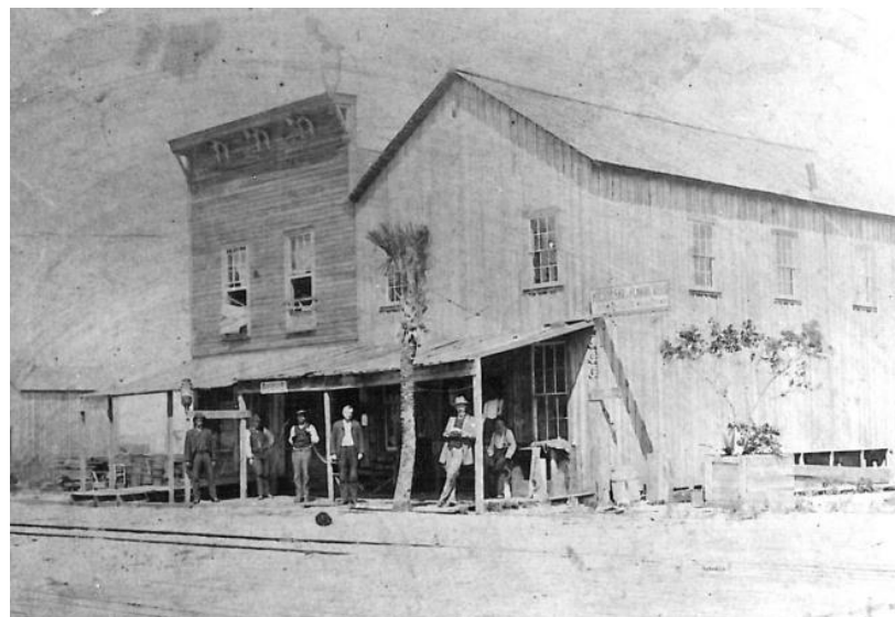
Figure 2: Urban Design Historic Archives: Commercial Building on King Street c. 1890’s