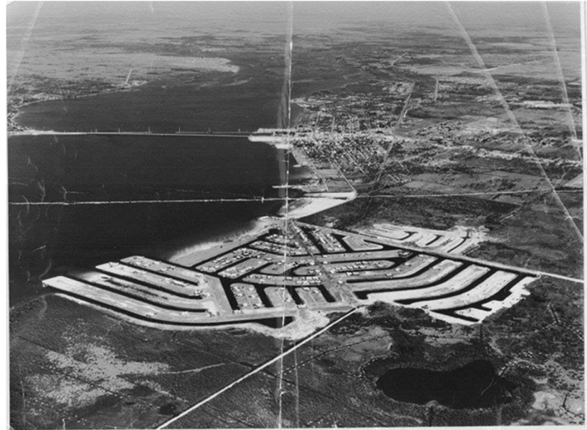
Figure 6: Urban Design Historic Archives: Punta Gorda Isles c. 1970’s