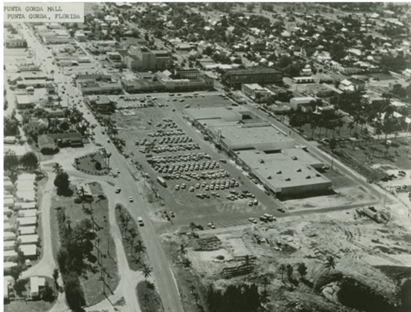
Figure 5: Urban Design Historic Archives: Punta Gorda Mall