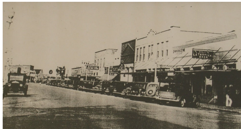
Figure 4: Urban Design Historic Archives: 100 block of Marion Avenue looking east c. 1930's

By the time the Great Depression begins in the rest of the nation in 1929, Floridians had already become accustomed to economic hardship. In 1929 the Mediterranean fruit fly invades the state and the citrus industry suffers. A quarantine is established and troops set up road blocks and check points to search vehicles for any contraband citrus fruit. Florida's citrus production is cut by about sixty percent. Commercial fishing nearly stops because of economic conditions from the hurricanes and the stock market crash in 1929. Fishermen are limited to three hundred (300) pounds of mullet per week, receiving only one cent per pound at times. With the stock market crash the last gasps of the Great Florida Land Boom crash as well.