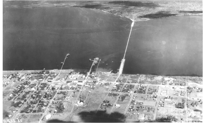
Figure 3: Urban Design Archives: 1924 Aerial Photo of Punta Gorda looking north to Charlotte Harbor