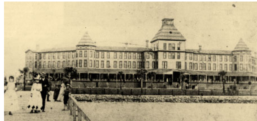
Figure 1: Hotel Punta Gorda c. 1887-1896