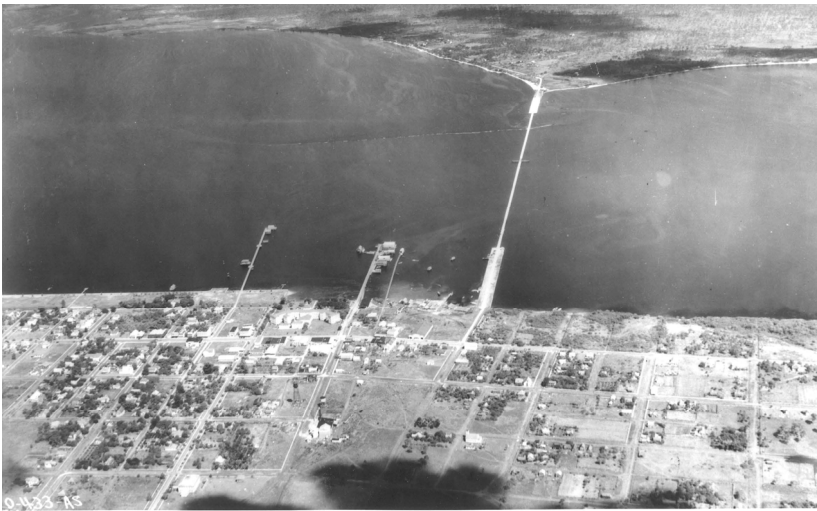
Figure 3: Urban Design Archives: 1924 Aerial Photo of Punta Gorda looking north to Charlotte Harbor