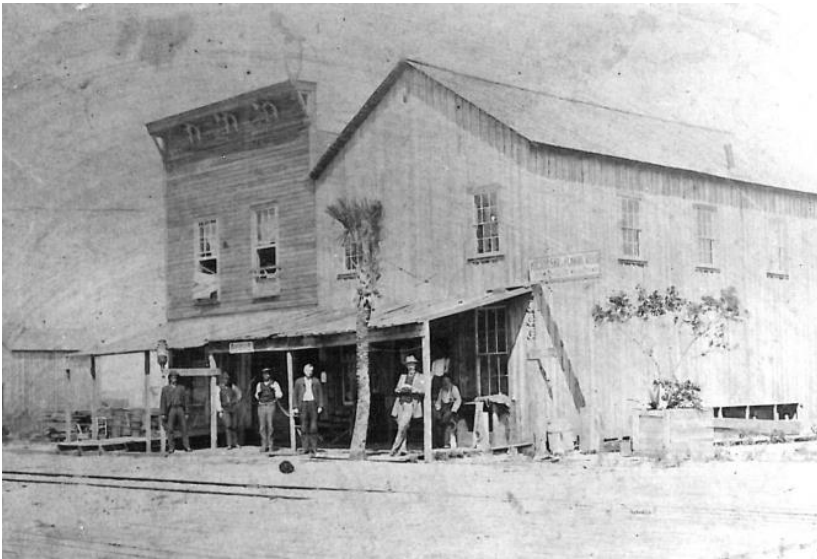
Figure 2: Urban Design Historic Archives: Commercial Building on King Street c1890's