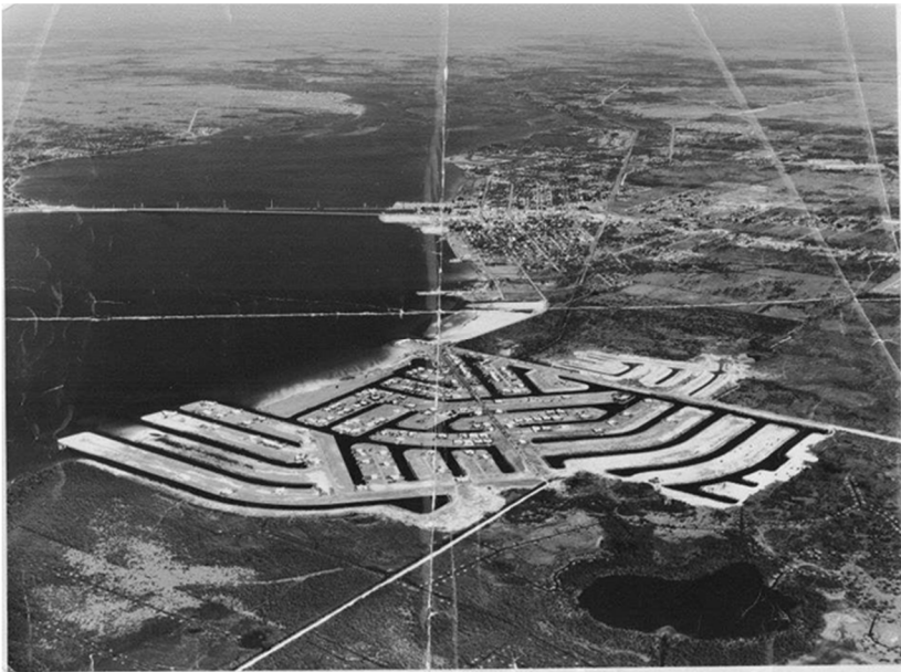
Figure 6: Urban Design Historic Archives: Punta Gorda Isles c1970's