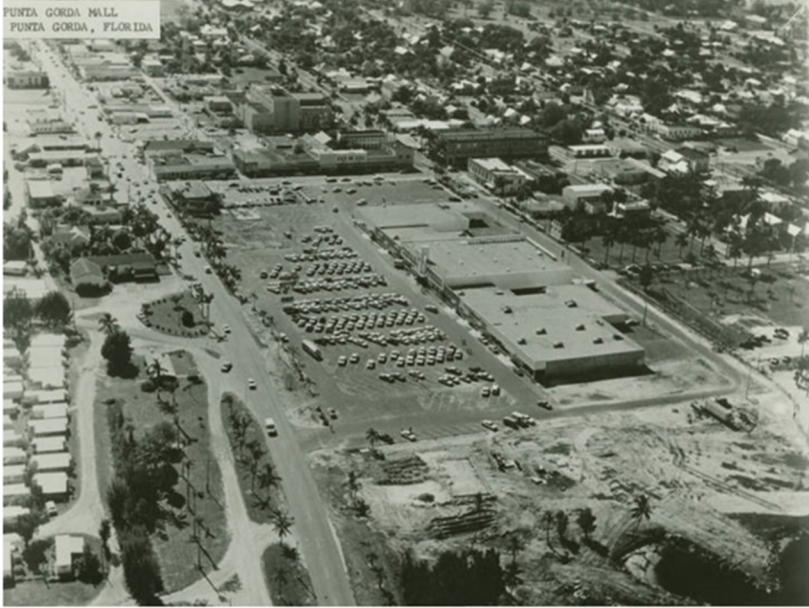
Figure 5: Urban Design Historic Archives: Punta Gorda Mall