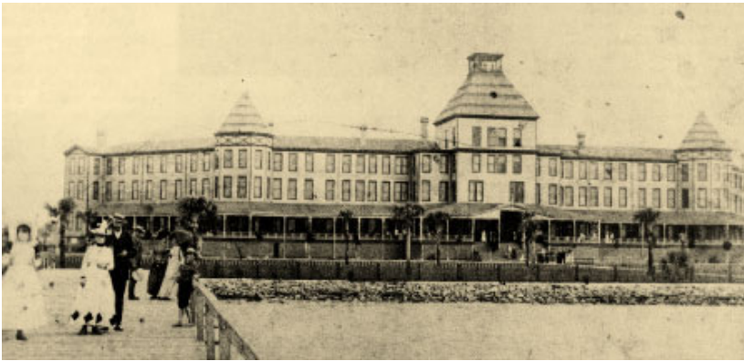
Figure 1: Urban Design Historic Archives: Hotel Punta Gorda c1887-1896