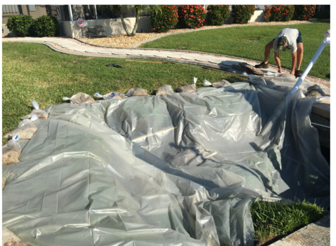
4. ARRANGE BAGS AND PLACE A FEW IN THE TRENCH TO KEEP PLASTIC FROM BLOWING IN THE WIND