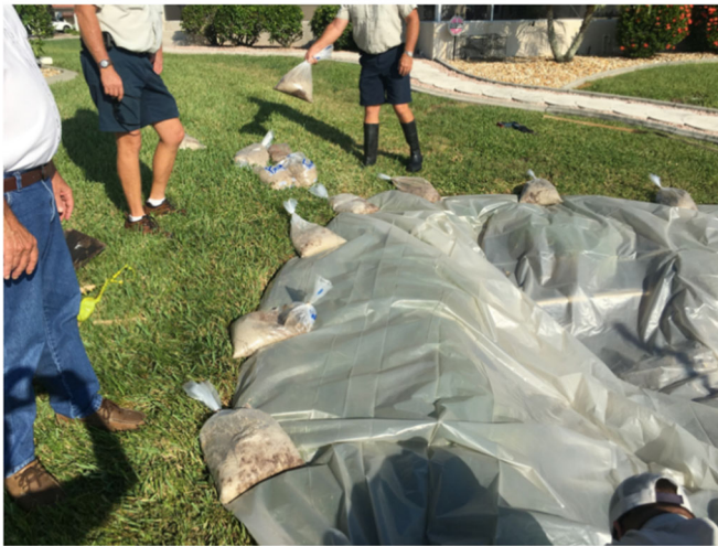
3. PLACE SANDBAGS ON THE TRENCH ALONG PERIMETER, LEAVING ABOUT ONE FOOT BETWEEN BAGS