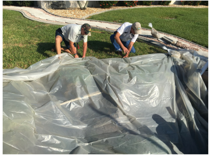
2. WORK PLASTIC SHEETING INTO TRENCH AND PACK SOIL TIGHTLY ALONG SHEETING