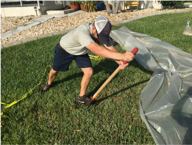
1. USE A FLAT SHOVEL TO TRENCH THE PERIMETER OF THE WASHOUT