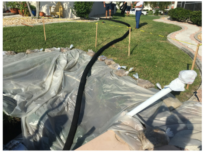
6. DIRECT PLASTIC DRAIN PIPE BEYOND WASHOUT AREA. USE SANDBAGS AND STAKES TO KEEP PIPE IN PLACE.