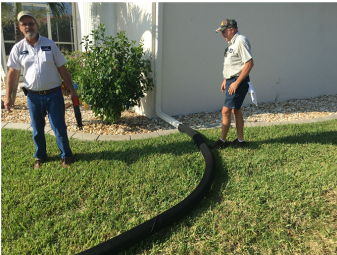
5. ATTACH FOUR INCH PLASTIC DRAIN PIPE TO DOWNSPOUTS