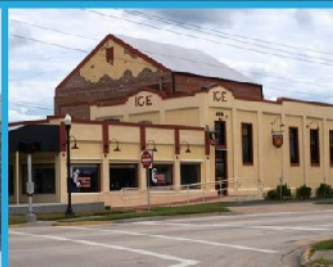
Punta Gorda Ice House