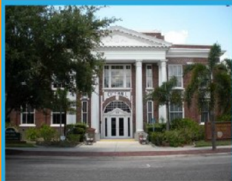
Punta Gorda City Hall