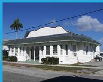
Punta Gorda Women's Club