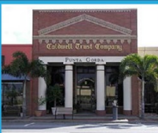
Old First National Bank