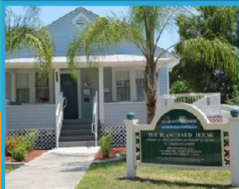
Blanchard House Museum