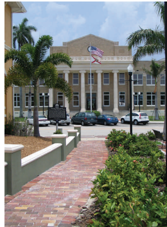
Old Charlotte County Courthouse C1928

City of Punta Gorda Historic Preservation Advisory Board Historic Preservation Fund Attn: Finance Department 326 W Marion Avenue Punta Gorda FL 33950