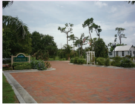
Punta Gorda History Park