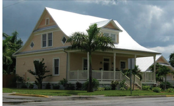
403 W Olympia Ave

It is our goal to preserve the unique history of Punta Gorda and to keep alive our heritage for all to enjoy.