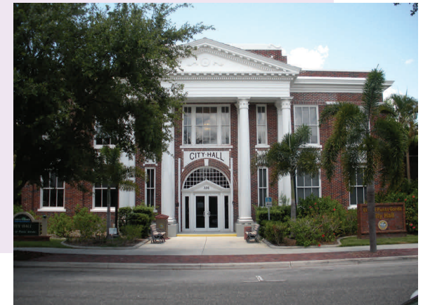
Punta Gorda Historic City Hall