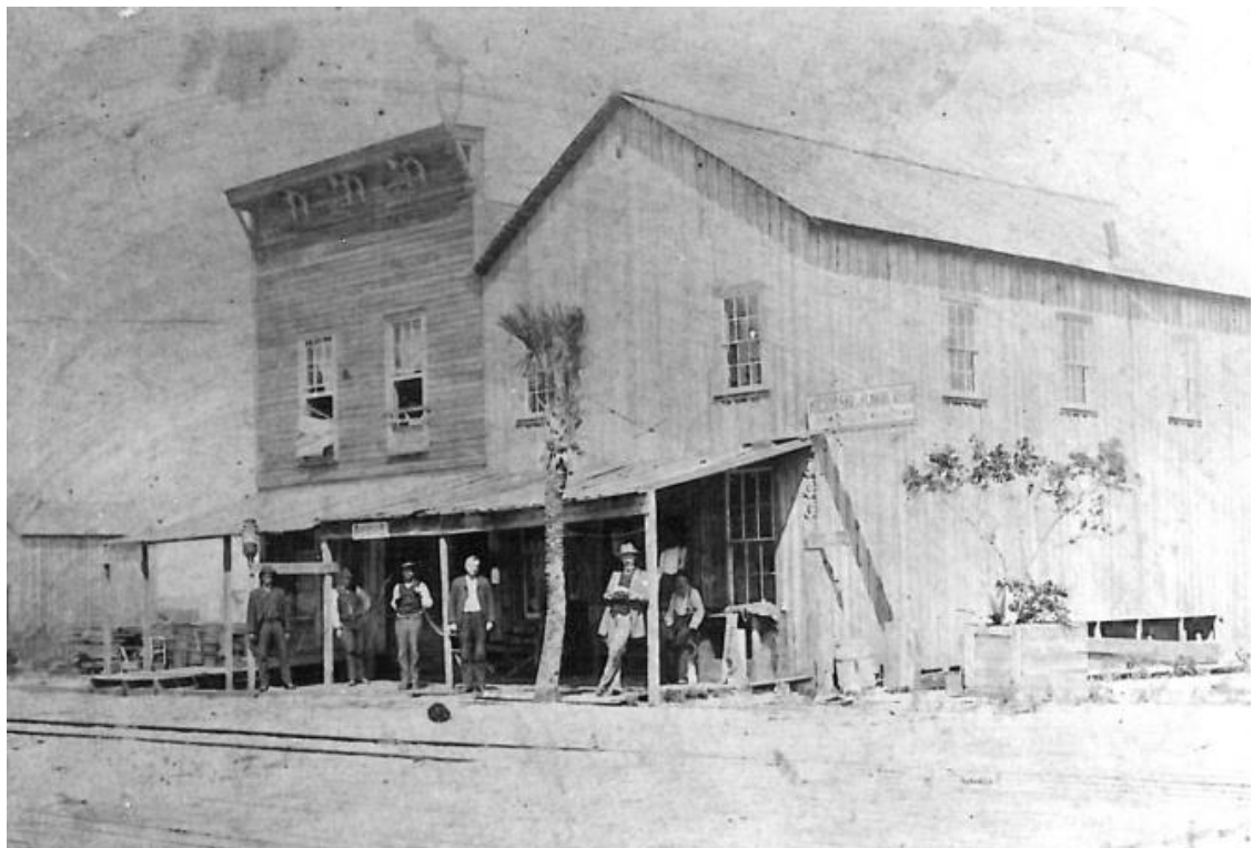
Figure 2: Urban Design Historic Archives: Commercial Building on King Street c1890's