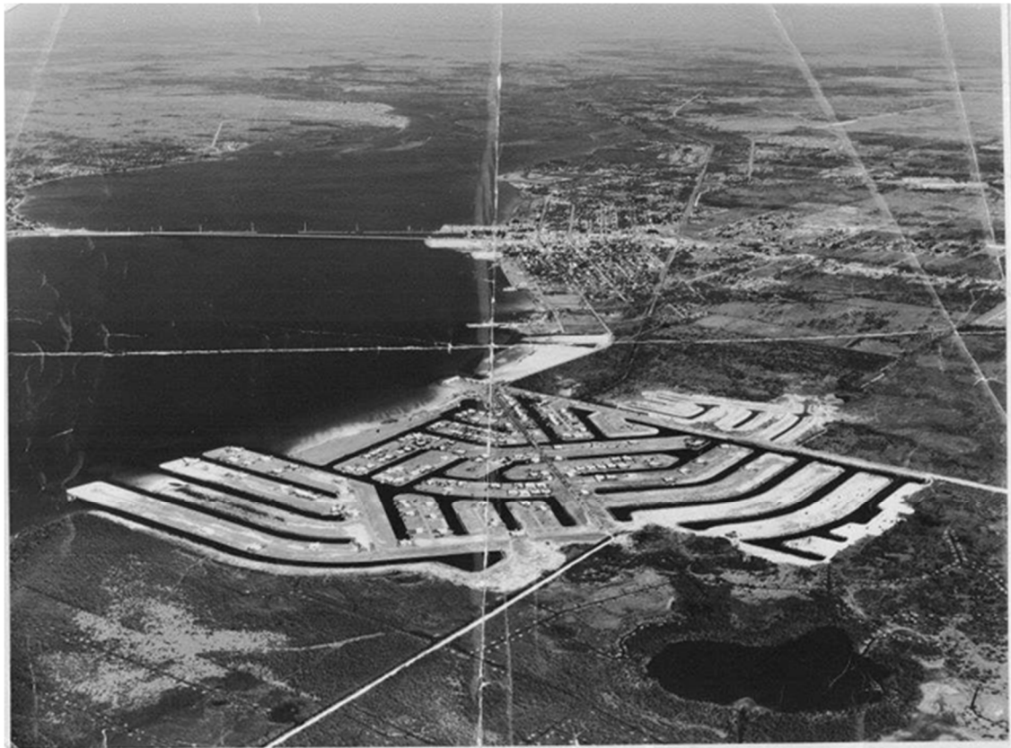
Figure 6: Urban Design Historic Archives: Punta Gorda Isles c1970's