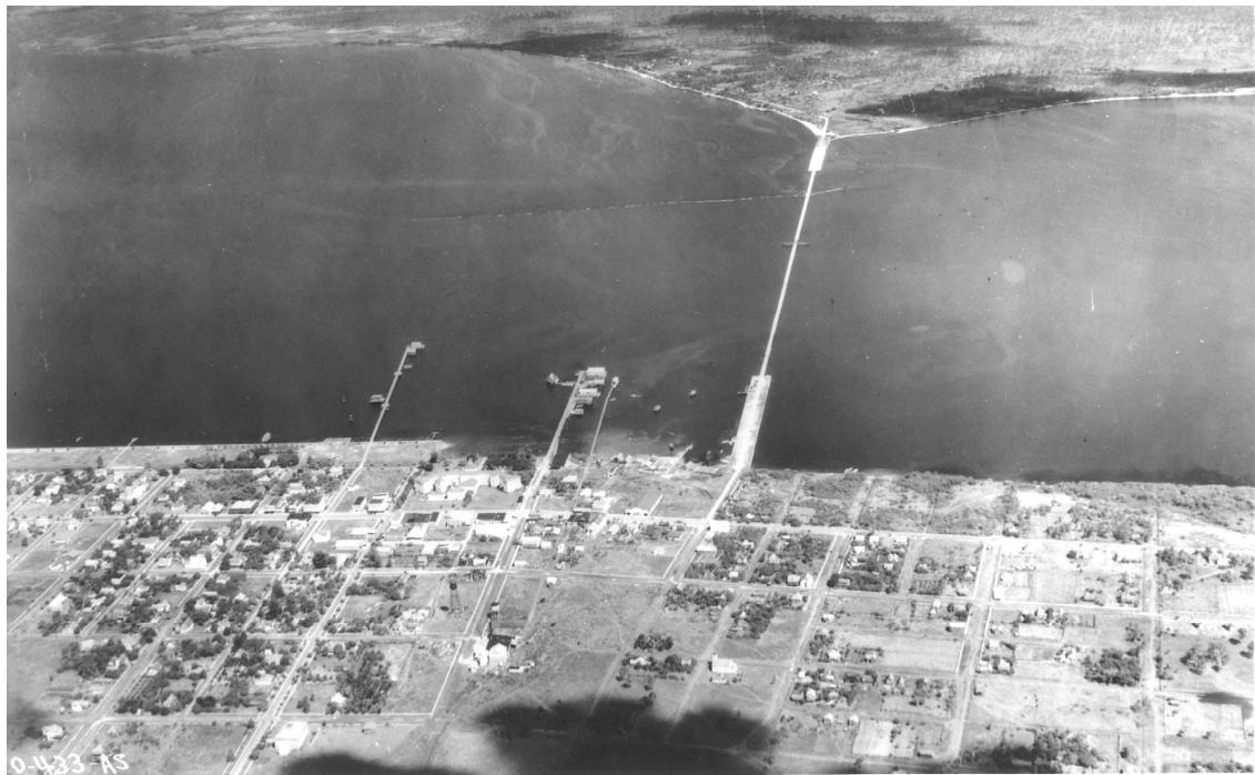
Figure 3: 1924 Aerial Photo of Punta Gorda looking north to Charlotte Harbor