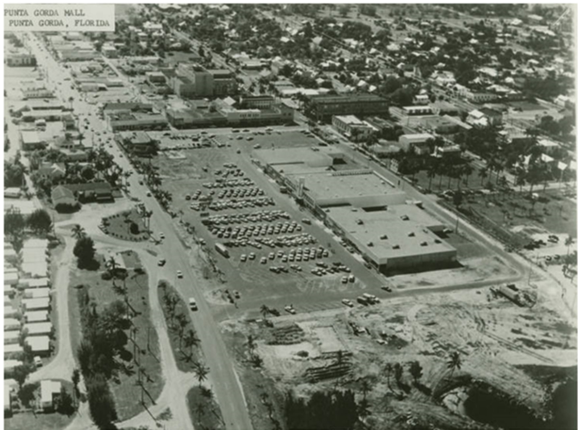
Figure 5: Urban Design Historic Archives: Punta Gorda Mall