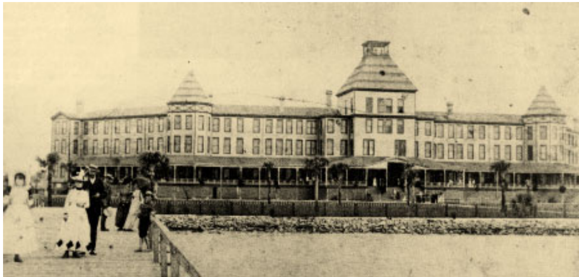
Figure 1: Urban Design Historic Archives: Hotel Punta Gorda c1887-1896