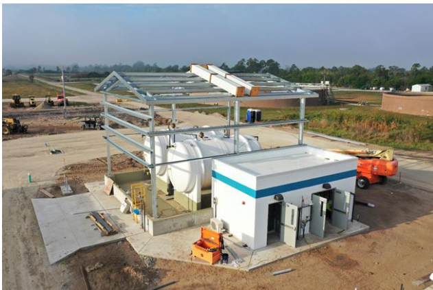
Week 90- New Bleach building and tanks