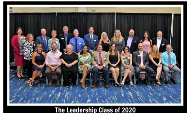
The Leadership Class of 2020

On Feb. 13, the City Manager, Punta Gorda Fire Department and the Punta Gorda Police Department provided the Charlotte County Chamber of Commerce Leadership program participants with an overview of operations. Participants were especially interested in the number of and duties of the volunteer police officers, the status of the new RO plant and why the Fire Department living quarters have four refrigerators. The wheel of lunch in the offices of the Police Department also sparked interest by participants. Thank you to all involved in sharing what a great community Punta Gorda is to live in and be a part of.