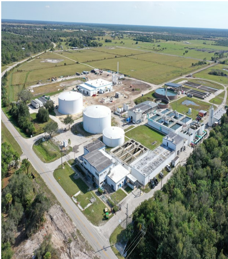
Week 81- Overview of plant.