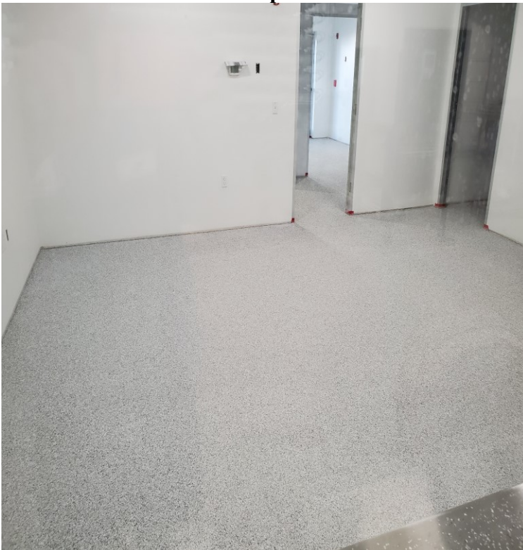
Week 79- Floors in the administration section of the building are being coated.