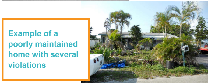
Example of a poorly maintained home with several violations

The following are some maintenance recommendations which you can utilize to keep your property in a safe and sanitary condition.