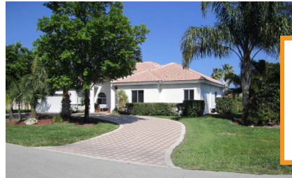
Example of a well maintained single family home

Neighborhoods and structures in the City of Punta Gorda require proper maintenance to stay in good condition as they age. (Maintaining good neighborhoods is the cooperation of individual property owners and tenants.) The Punta Gorda City Council has adopted a code of ordinances, which create minimum standards for the improvement of our neighborhoods. These standards protect surrounding property owners and tenants from having property values negatively affected by substandard conditions.