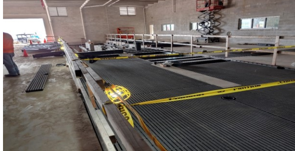
Week 66 – Installing the decking in the RO process room

Groundwater R.O. Construction Update – In addition to the water quality improvements the Groundwater R.O. plant will provide the project will also greatly improve the reliability of the water supply by providing a groundwater source in addition to the existing supply from the creeks.